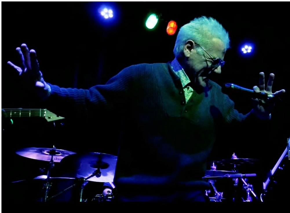
Performing in 2020 with his Showstopper “Memphis Soul Machine” band!