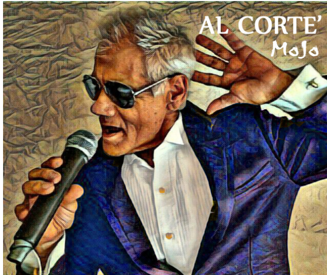
"Mojo" cover art by Mike Swartz

MOJO – RELEASED 2017 SEASONED SOUL - RELEASED 2015 DISTRIBUTION: CD BABY SELF RELEASE FCC CLEAN