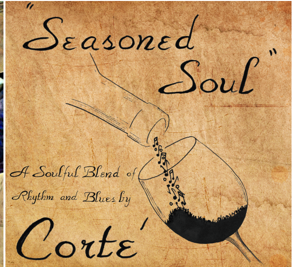
"Seasoned Soul" cover art by Chance Bone

"SEASONED SOUL" VOTED BEST SELF PRODUCED CD THE MEMPHIS BLUES SOCIETY