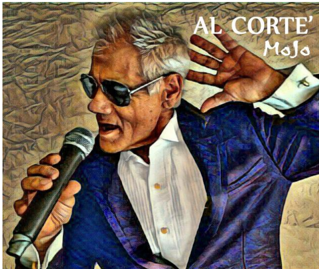
"Mojo" cover art by Mike Swartz

NEW RELEASE MOJO - 2017 SEASONED SOUL - RELEASED: 2015 DISTRIBUTION: CD BABY SELF RELEASE FCC CLEAN